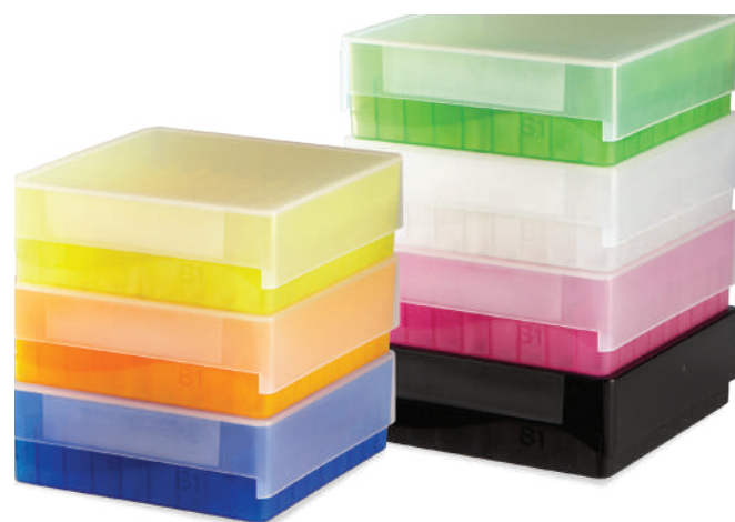
Pack of 5